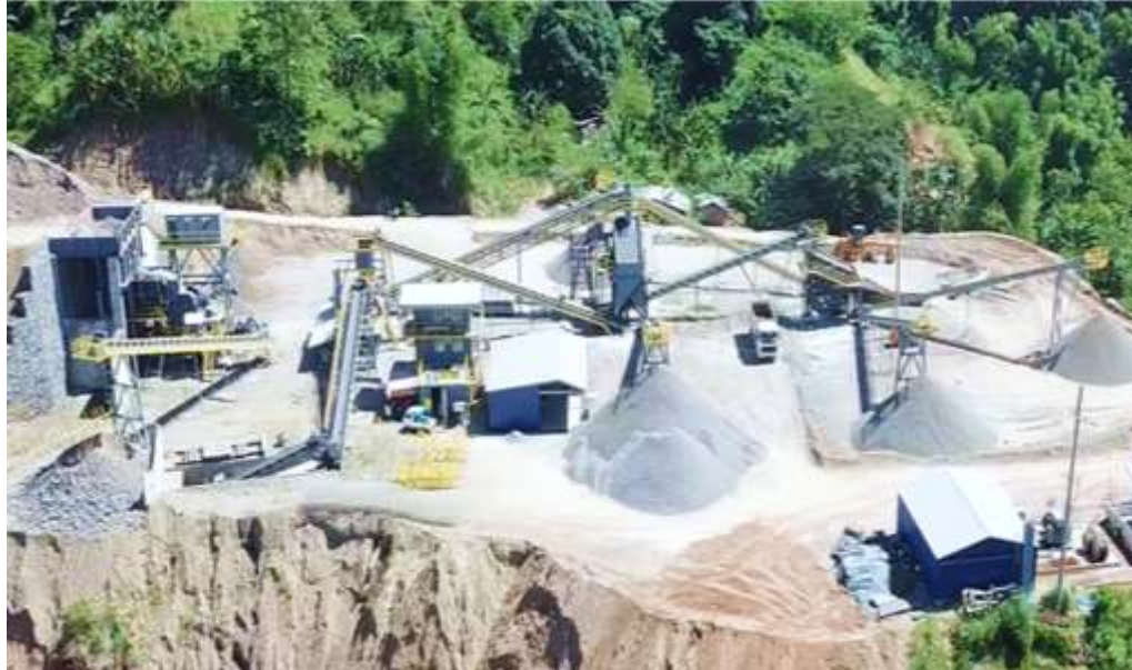
Barangay Macabud, Rodriguez, Rizal

INFRASTRUCTURE SUPPLY ROCKS & AGGREGATES Ready Mix Concrete Pre-cast concrete products