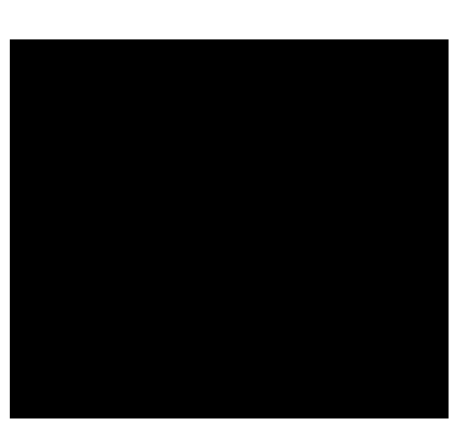
9TH FLOOR SUMMIT ONE TOWER 530 SHAW BOULEVARD, MANDALUYONG CITY 1500

TEL: +632-4040239, +632-7170523 EMAIL: atn_infra.summit@tbgi.net.ph