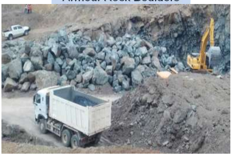
20,000 TRUCKLOADS STOCKPILE